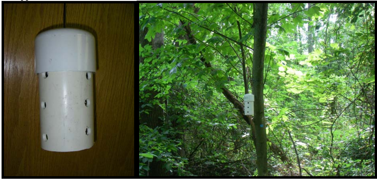
Figure 2. PVC shield for air temperature HOBO. Dimensions: 3in PVC, 6in long, <sup>1</sup>/<sub>2</sub>in drilled holes for air flow (12)