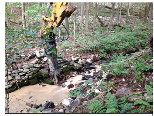
Removing jack dam between two former dams