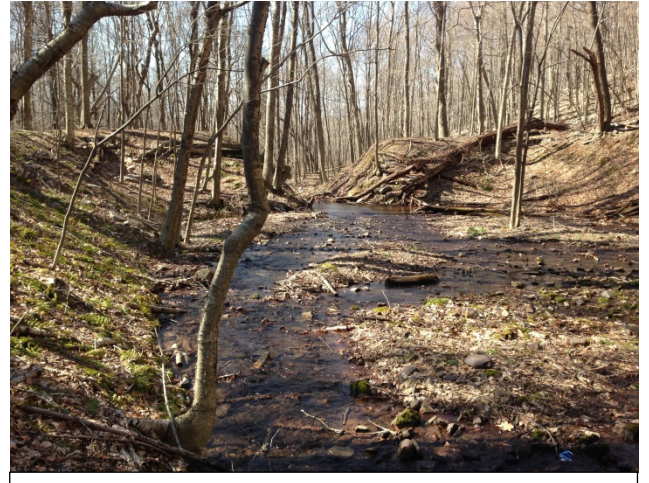
Upper dam and impoundment, before