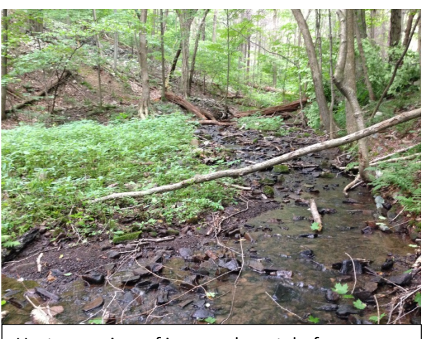
Upstream view of impoundment, before