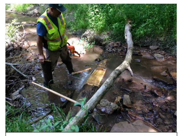
Notched cross-log in downstream former impoundment