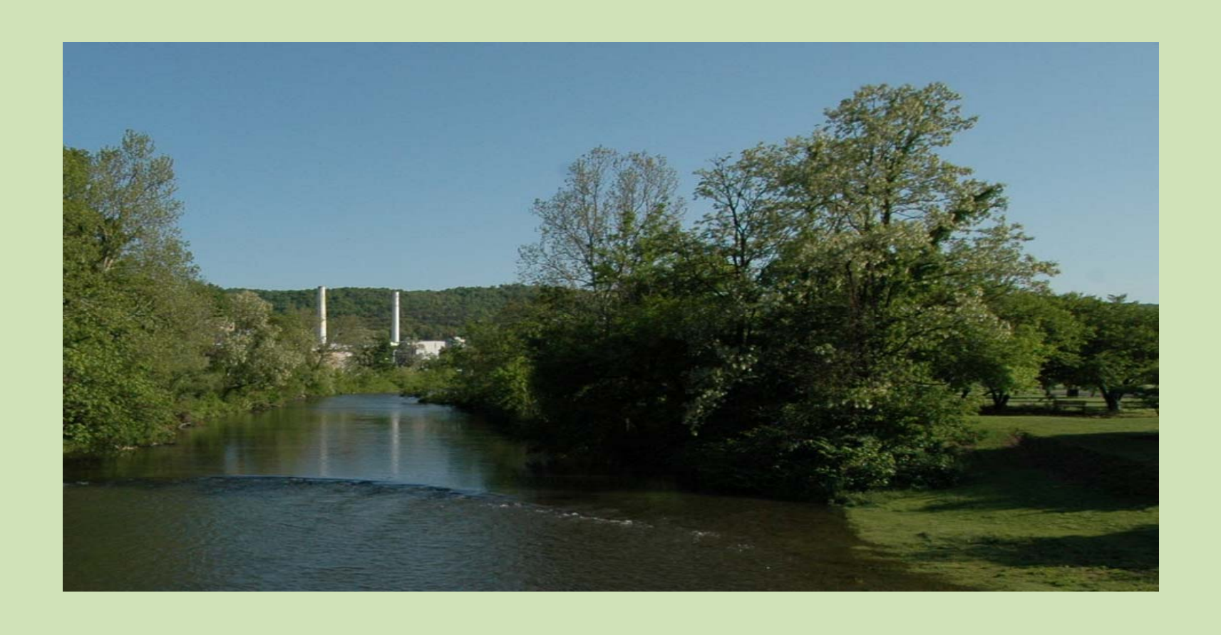
Virginia's Largest Spring-fed River