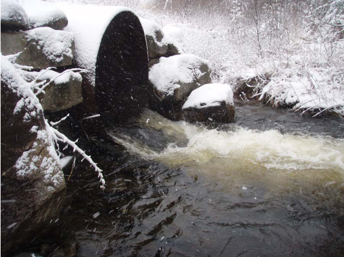
The culvert on Umpire Brook was made from an old boiler tank. The outlet is perched about 10" higher than the water's surface. winter 2008.