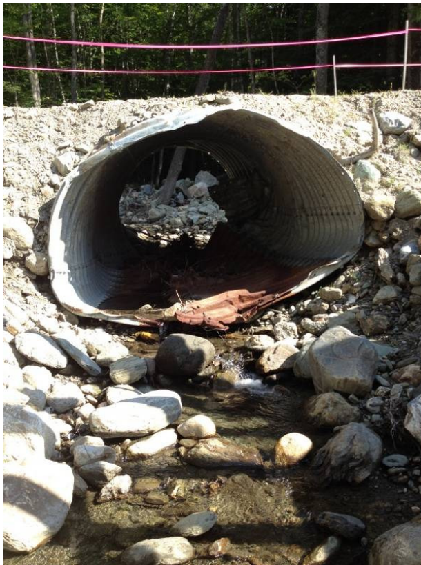
Nason Brook culvert at Woodlawn Cemetery