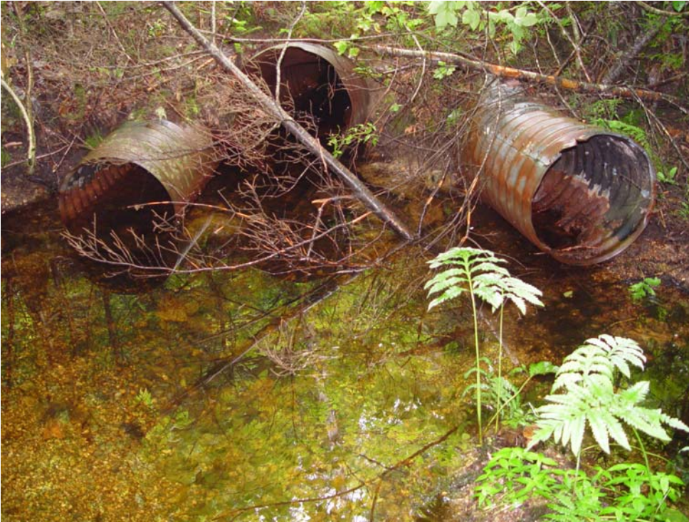
4 th Machias tributary culvert outlets, July 2006