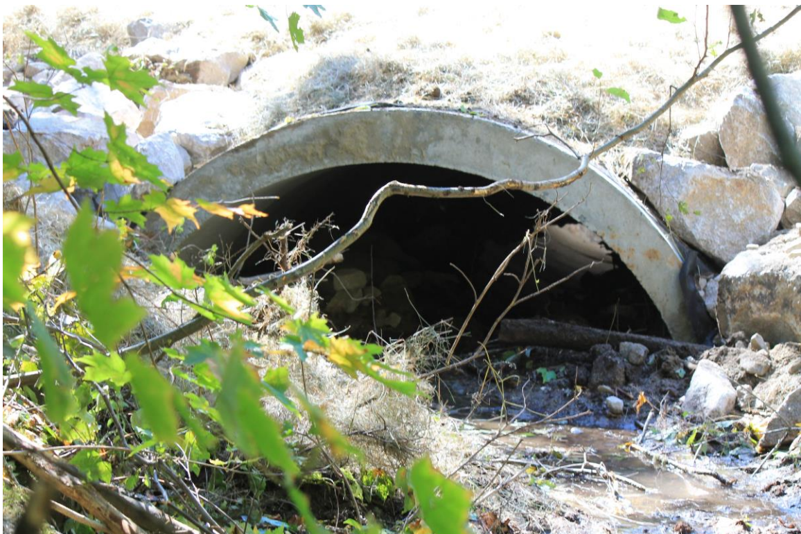
Billy Brown Brook at Shaw Street crossing after arch culvert installation in 2014.