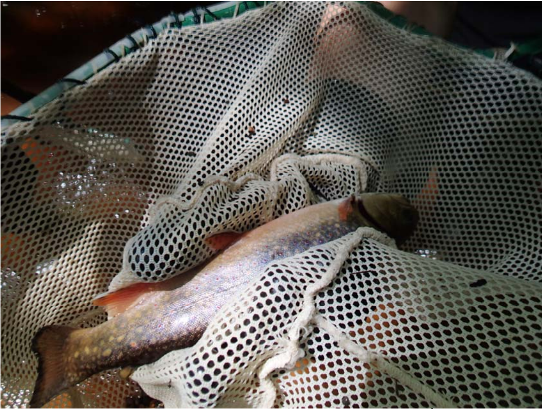
Brook trout, Billy Brown Brook, July 2013, below installation at 4 th Lake Rd