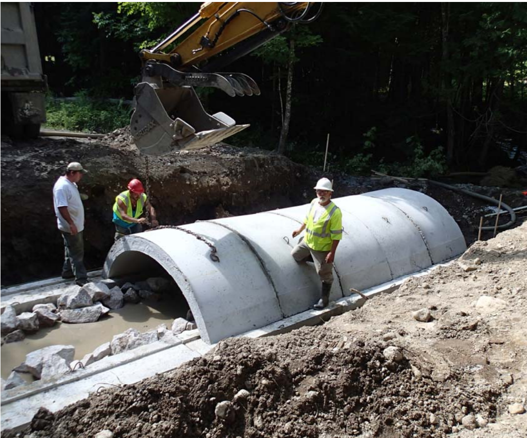
Assembling concrete arch culvert, July 30, 2013