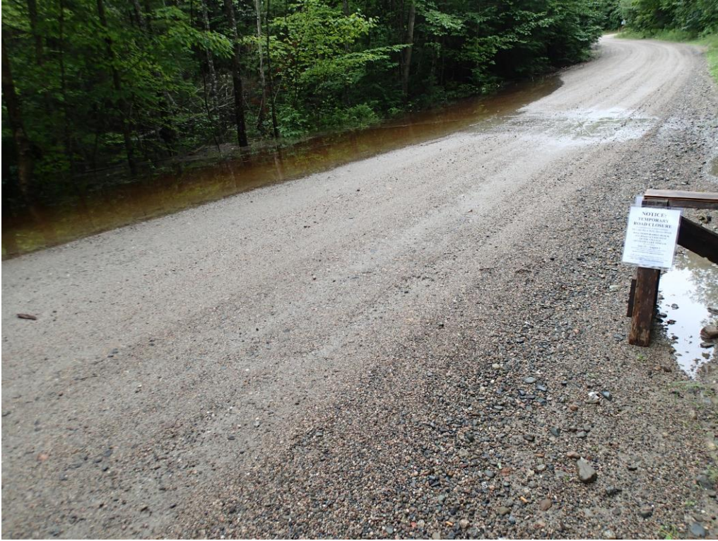
4 th Lake Road crossing of Billy Brown Brook before and after (2013).