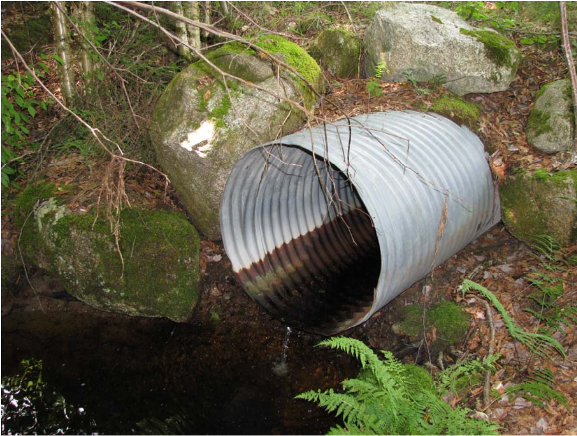
Burroughs Brook culvert outlet, August 2012