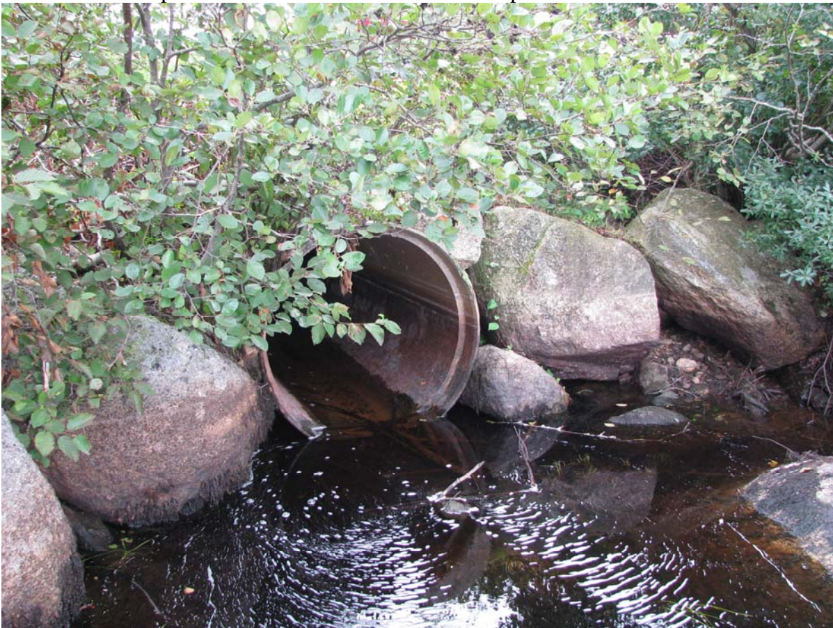
Mud Turtle Brook, lower crossing, culvert outlet, August 2012