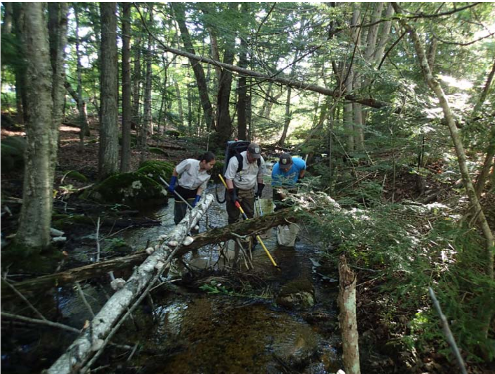
USFWS personnel electrofishing Billy Brown Brook prior to construction 2013