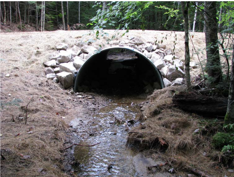
4 th Machias tributary arch culvert outlet, Sept. 2012, immediately post construction