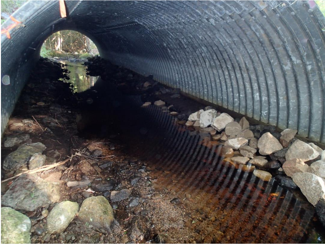
Belden Brook arch culvert (2012)