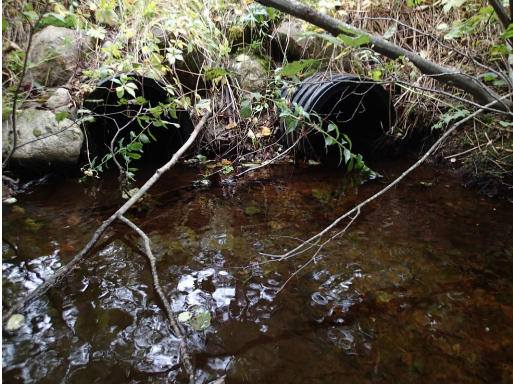
Billy Brown Brook at Shaw Street crossing prior to arch culvert installation in 2014.