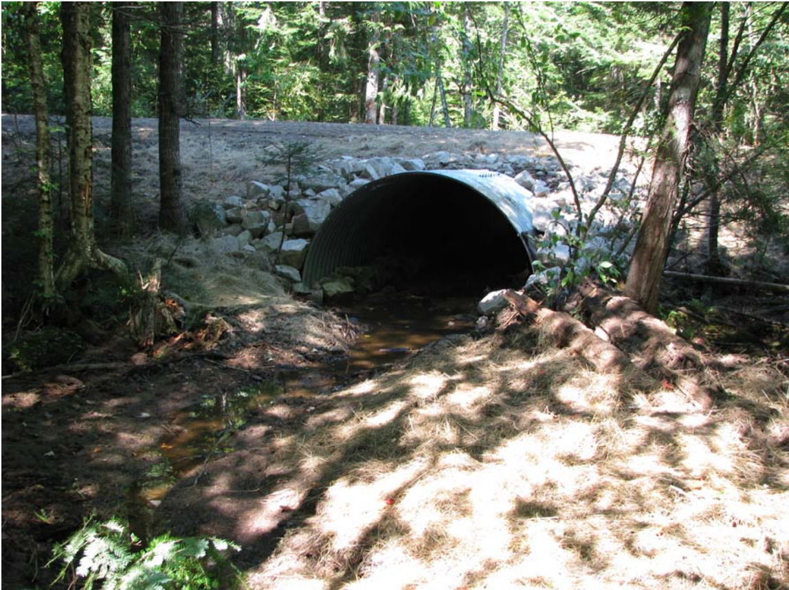
Burroughs Brook arch culvert outlet, August 2012 immediately post construction