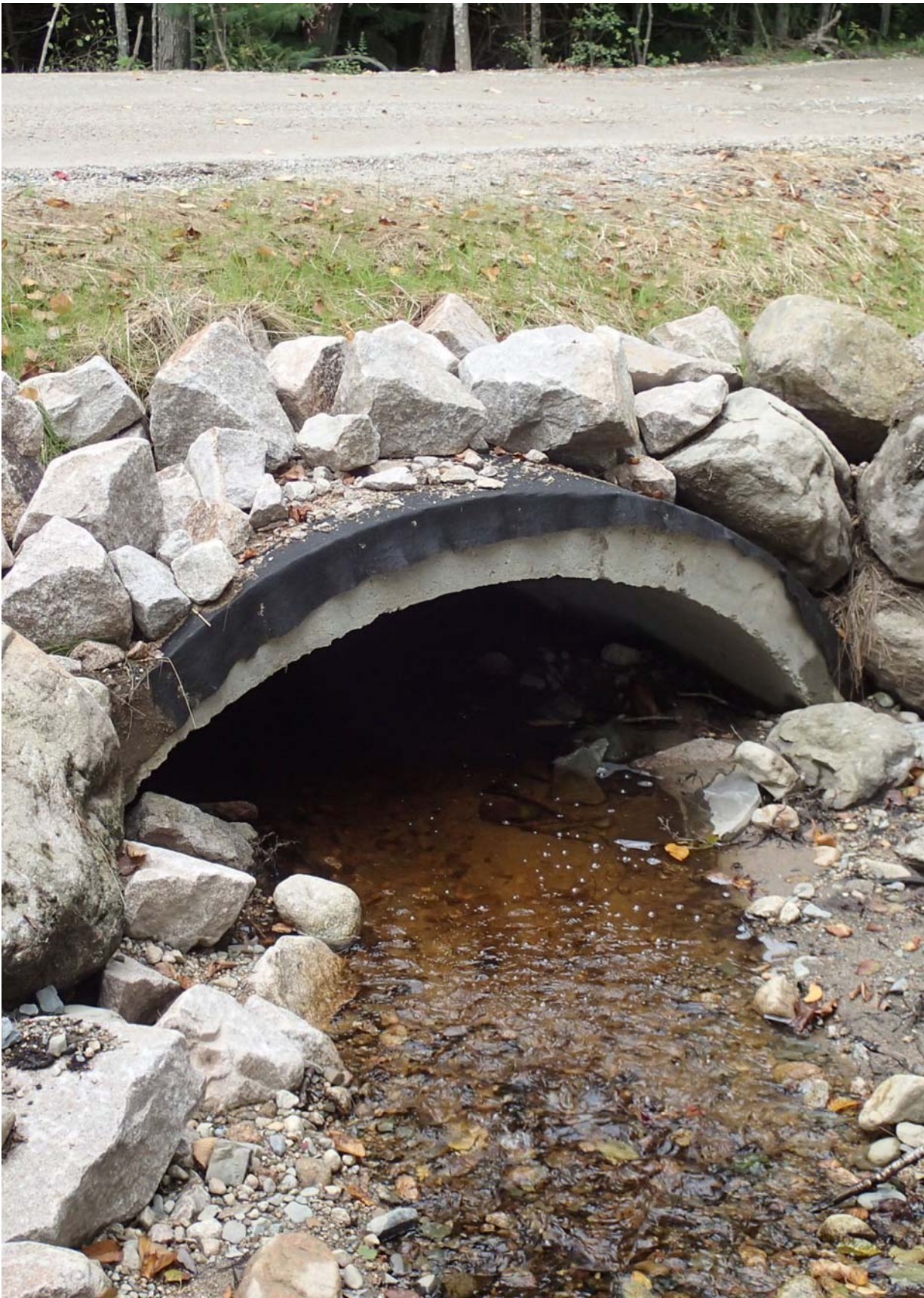
Inlet of concrete arch, Billy Brown Brook at 4 th Lake Rd, Sept. 15, 2013