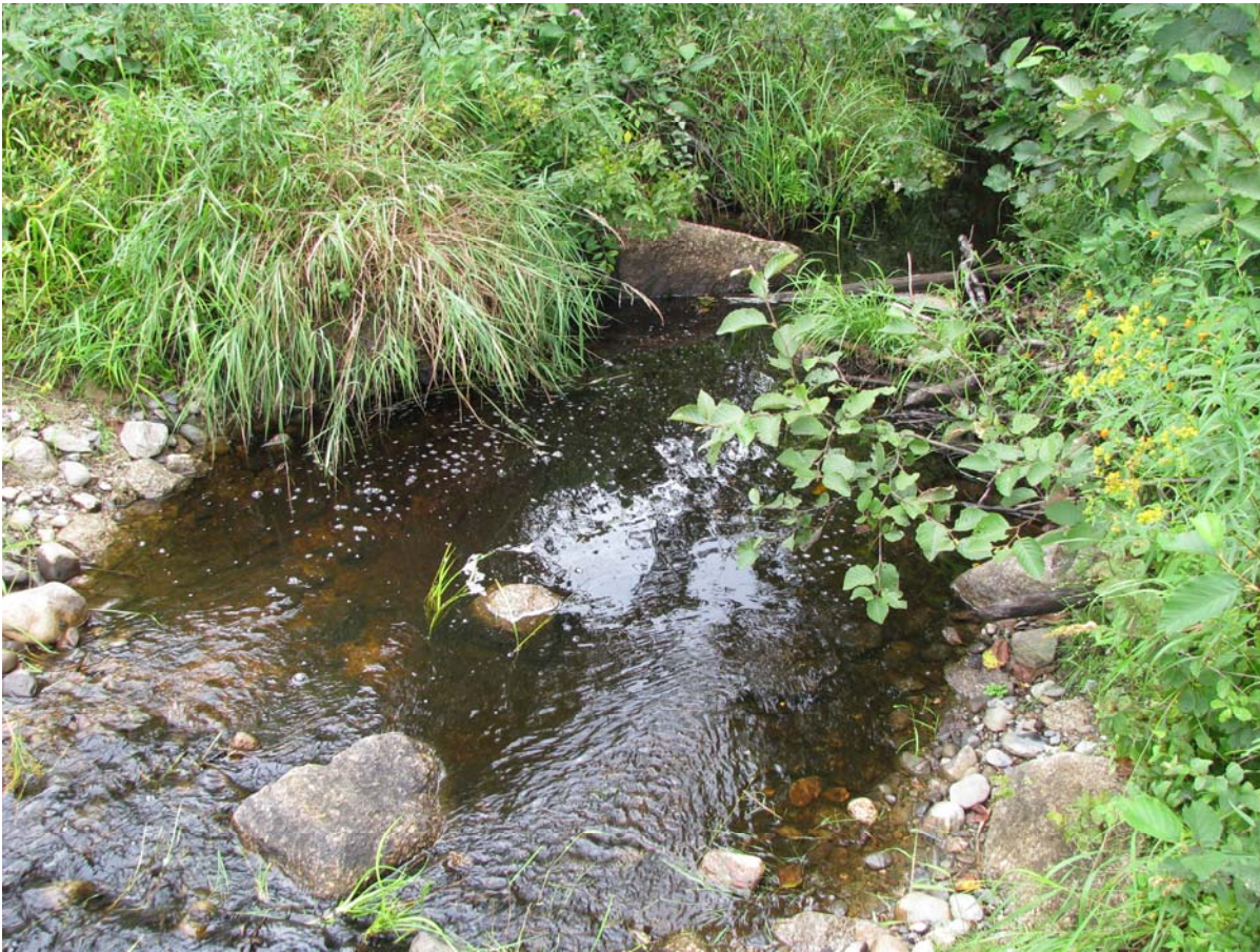
Mud Turtle Brook, upper crossing, washed out, August 2012 Post construction photos from Mud Turtle Brook will be provided in 2013.