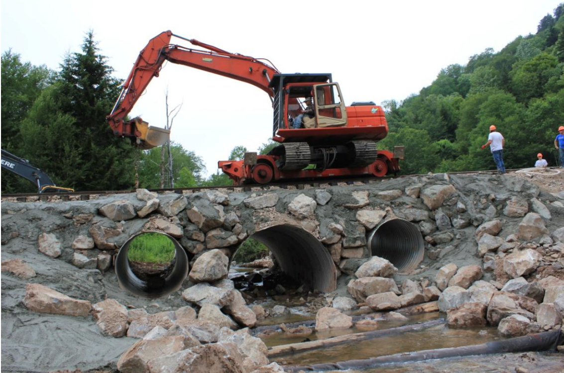
Figure 1: Fish Passage at Beaver Creek, Upper Shavers Fork, WV

Utilizing equipment suitable for worksites accessible only by rail, WVDNR will replace the barrier culverts with a baffled and embedded thalweg culvert and two bank full overflow culverts (see Beaver Creek example below). A simulated stream will be constructed in the embedded thalweg culvert (center), and NSD step-pool systems will establish new “connector” channels above and below the replaced culverts. Baseline data collection, surveying, preliminary NSD designs, and landowner agreements have been secured.