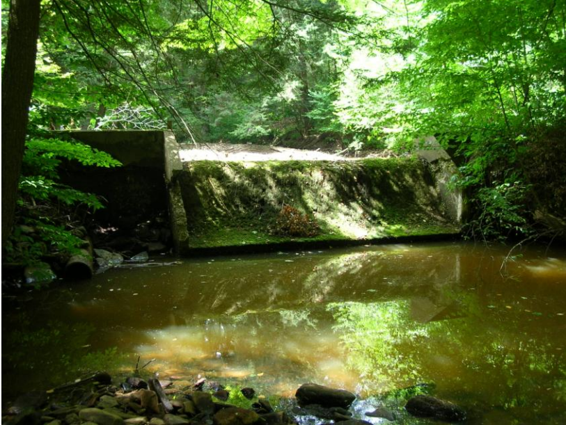
Dam on Wetmore Run – Looking upstream at face of spillway

Note: No water is going over the spillway showing the advanced state of disrepair of the structure.