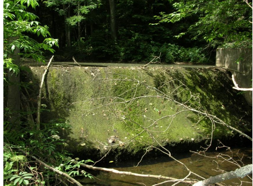
Dam on Right Branch Wetmore Run – Looking upstream at face of spillway

Note: No water is going over the spillway showing the advanced state of disrepair of the structure.