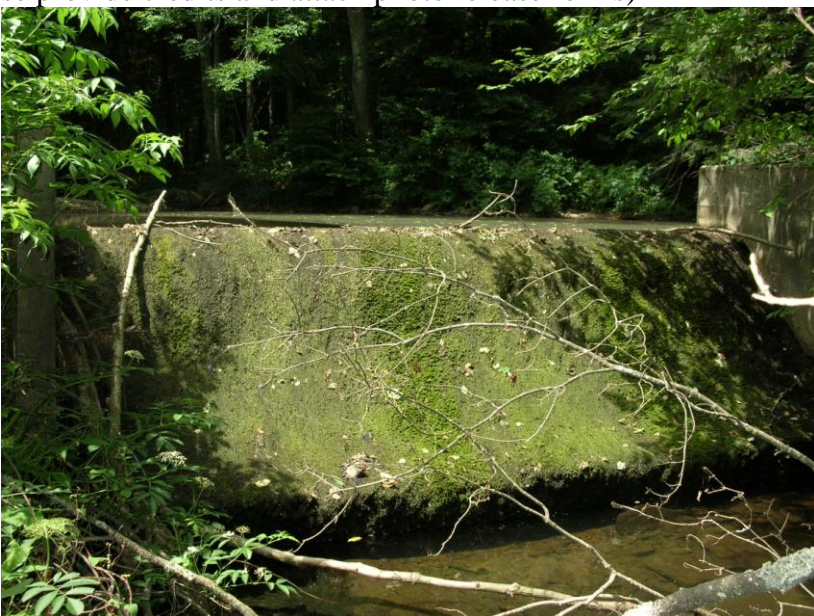
Dam on Right Branch Wetmore Run – Looking upstream at face of spillway

Note: No water is going over the spillway showing the advanced state of disrepair of the structure.