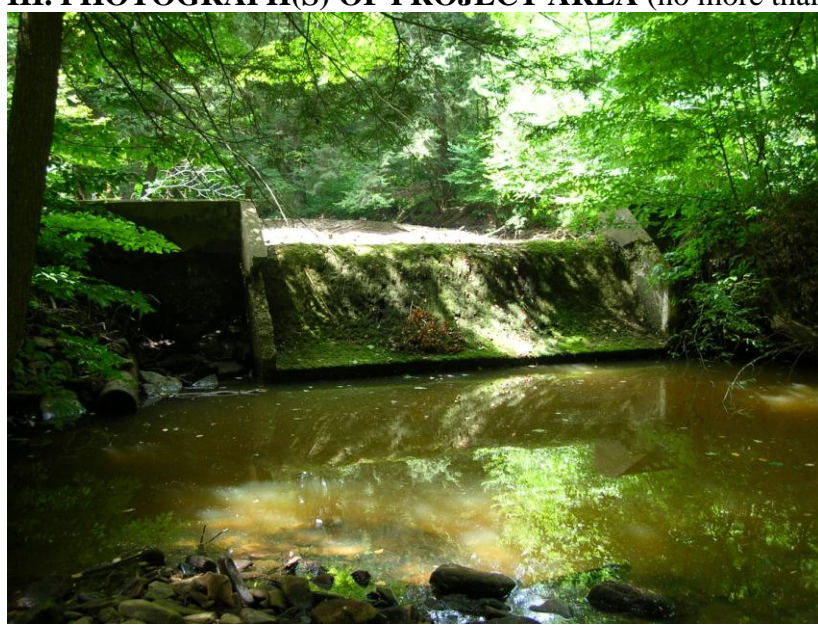
Dam on Wetmore Run – Looking upstream at face of spillway

III. PHOTOGRAPH(S) OF PROJECT AREA (no more than 2, please provide credits and attach photo release forms)