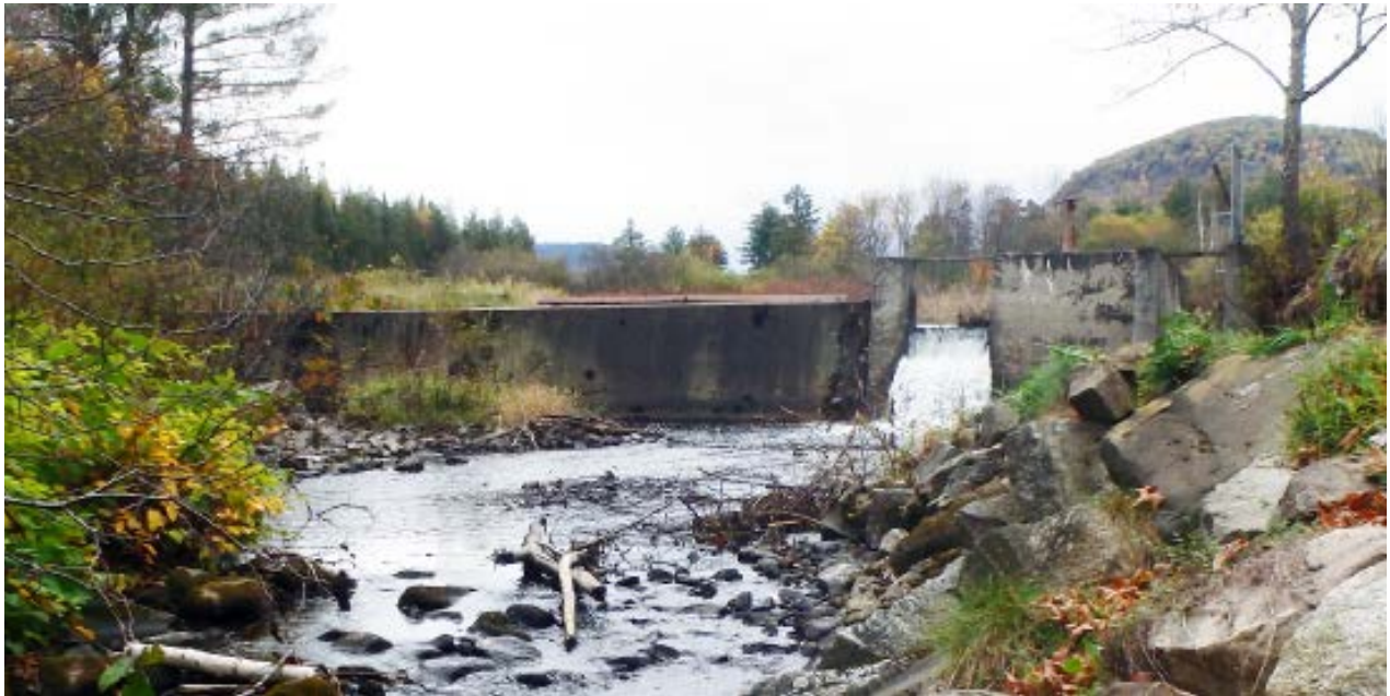
Looking upstream at the dam on South Peacham Brook in Barnet, VT.